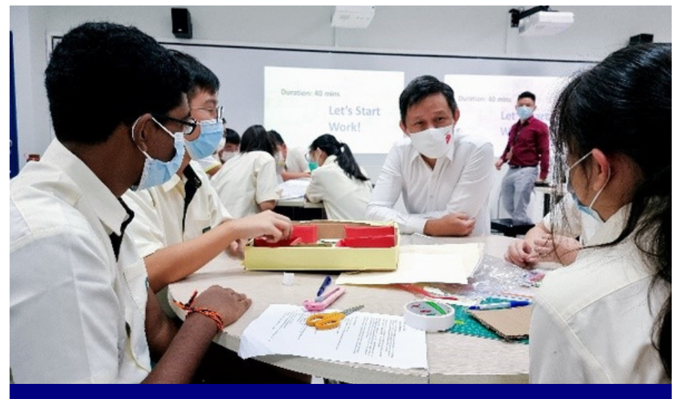
Our Sec 2-2 students engaging Minister Chan on their ALP prototype for the elderly.