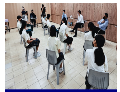
Minister Chan meets our students ranging from Secondary One to Five for an engaging conversation.